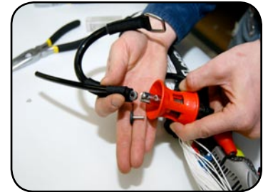
Pull out washer pin and the chicken loop will completely disassemble from the Iron Heart.