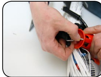
Secure chicken loop back into place by inserting Iron Heart pin through "V" ring and into the Iron Heart.