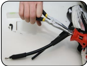
With pliers, bend cotter pin ends backwards and back around washer pin.