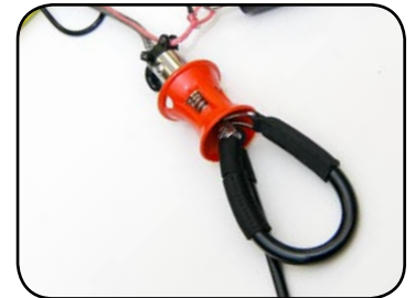
Finished as shown!