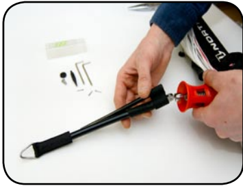
Hold back Iron Heart with one hand while inserting chicken loop end with the other.