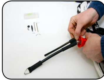
Insert washer pin.