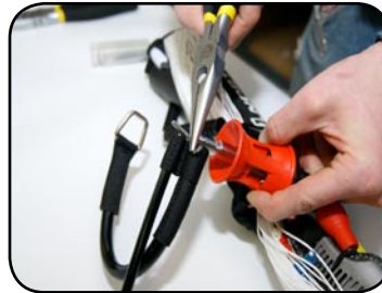
Pull cotter pin through the other side and out.