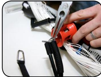
Use needle nose or blunt nose pliers to crimp eye of cotter pin.