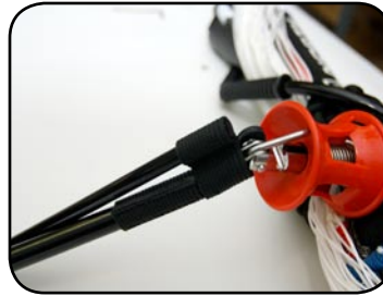
TIP: To free a hand for the remaining steps, stand up Iron Heart Pin against Iron Heart to keep it from springing up.