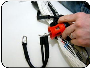
Pull Iron Heart to release chicken loop.