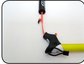
Pull up float to expose line ends.