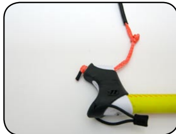
Tighten and pull through bar end hole.