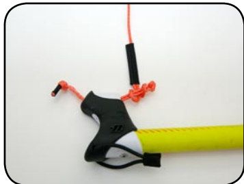
Slip lark heads over end knot.