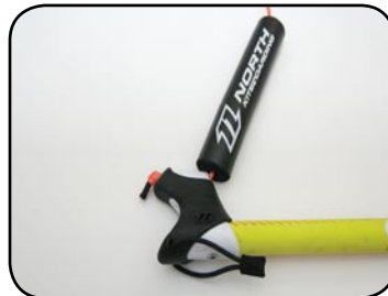
Slip float back over knot line.