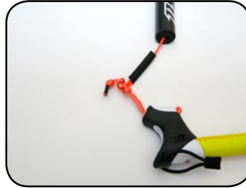
Loosen lark heads loop...