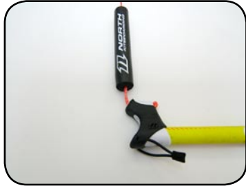
Standard stock setting for lines attached to bar.