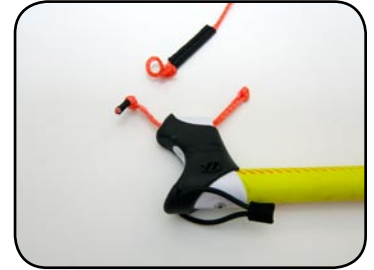
And slip over knot. Pull bar line loop through hole to the other side as shown.